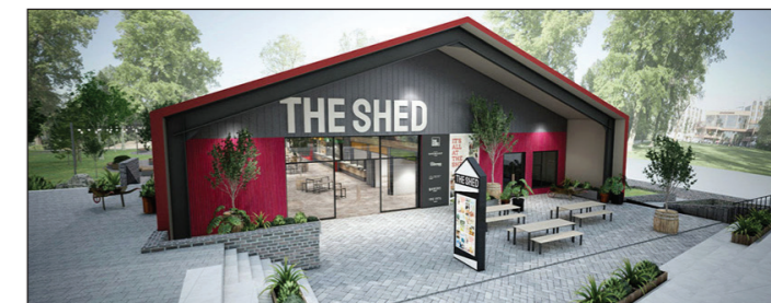
How The Shed will look

The Shed is a fabulous showcase of small independent businesses, generating a vibe and energy that only the passion of the small independents can