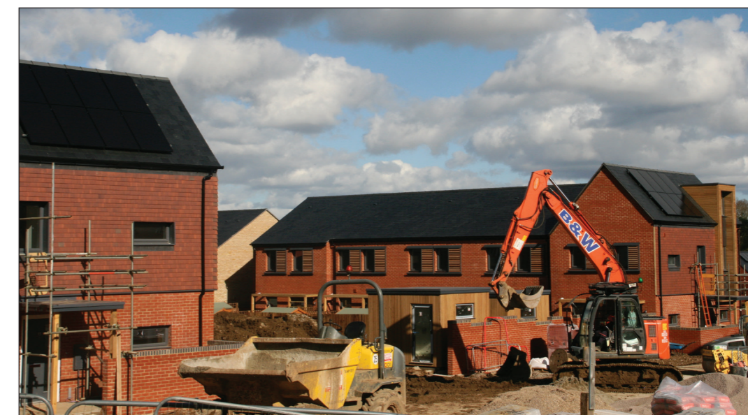
House building continues at pace in Bordon

"Many of these surrounding villages have some extremely old dwellings dating back several hundred years which means specialist trades are also in demand."