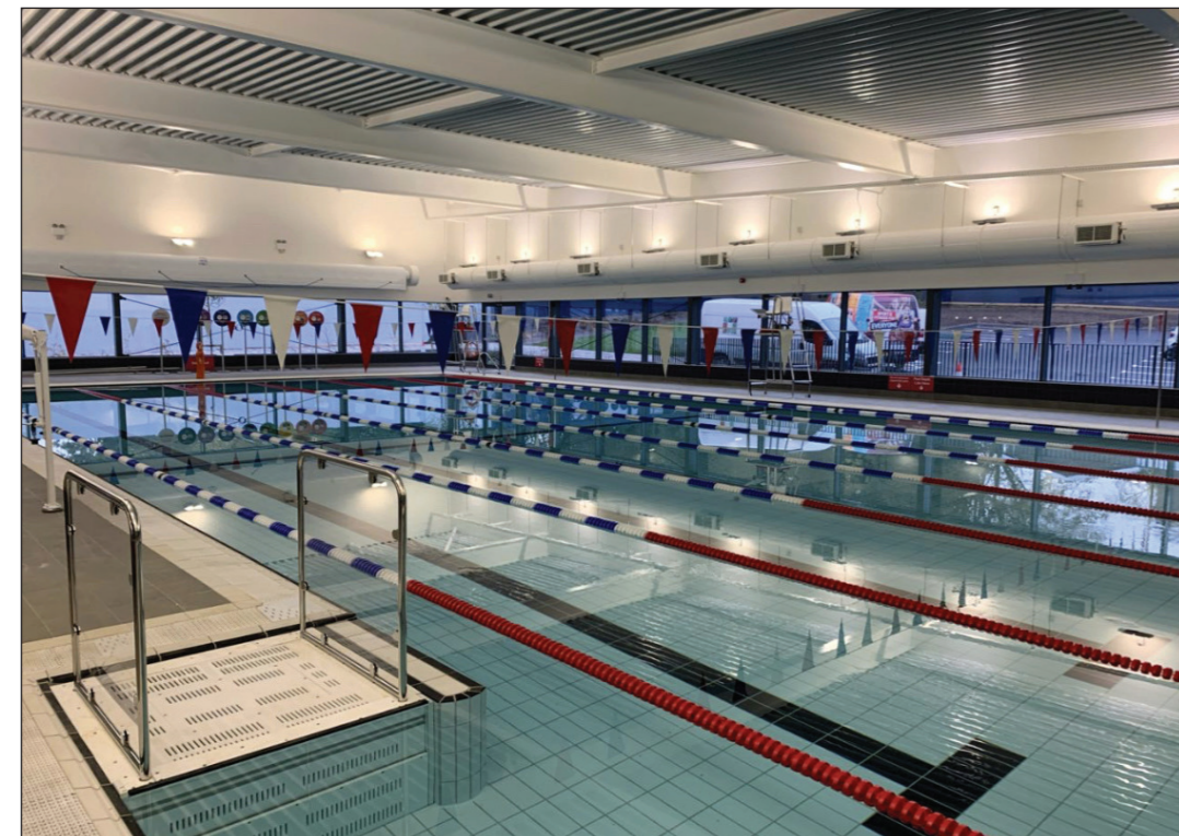
Inside the magnificent new Bordon leisure centre

Infrastructure projects include the Future Skills Centre, a progressive further education centre training bricklayers, plumbers and carpenters, BASE enterprise centre, the new relief road, the sports and leisure centre, the BOSC – a cricket pavilion, bar and restaurant with