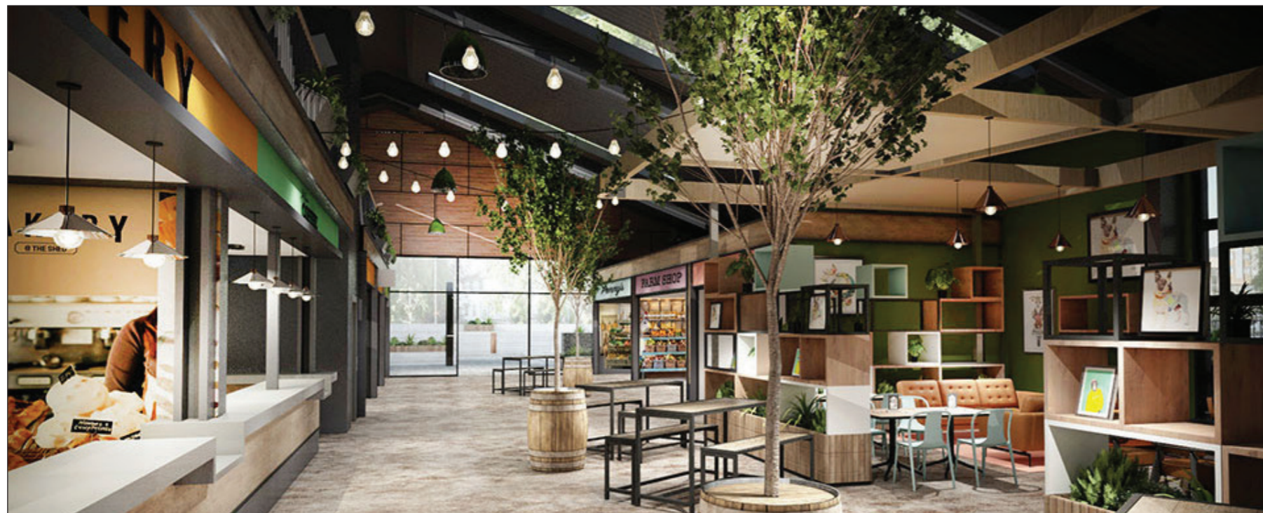
How the interior of the long-awaited Shed development will look

great sports facilities – and the new Oakmoor Secondary School.